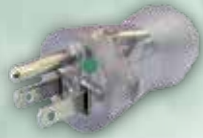
BC20-20400 North America Hospital Grade