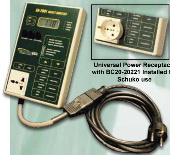
Universal Power Receptacle with BC20-20221 Installed for Schuko use