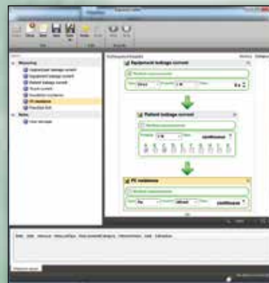
PC Interface (Included)

There are two modes of operation, Manual and Remote. The Manual Mode allows most of the basic testing functions to be stepped through one at a time. With the Remote Mode, measurements are controlled via a PC. The user has the possibility to integrate all measurements into the individual operator interface at the PC and to define test sequences.